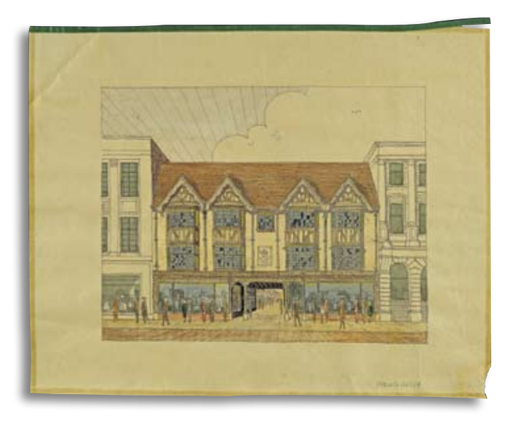
The Walk, Ipswich