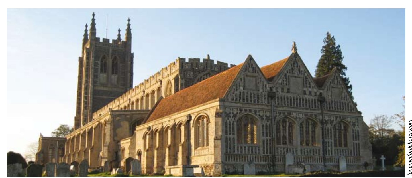
Long Melford Church – now with tower dating from 1903